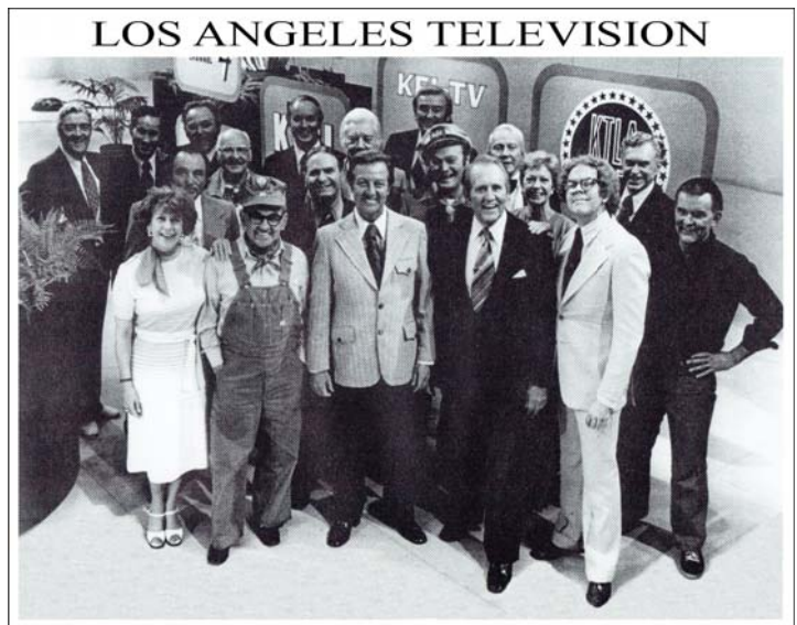
Names of former and current PPB members are underlined.

Los Angeles television history began in the small room of an auto dealership in 1931. Since then, much of the nation's TV history has been made here: the first television helicopter, the first big story that TV broke before newspapers, the first live coverage of an atomic bomb, and the careers of numerous icons. The book contains hundreds of photos and is available at retailers everywhere and on-line.