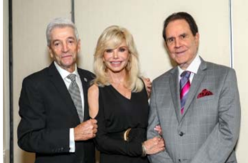
Three deserving PPB luncheon honorees: TOM DREESEN , LONI ANDERSON , and RICH LITTLE .