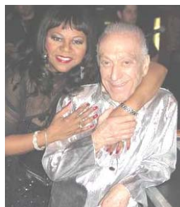
Singer DENIECE WILLIAMS with ART LABOE.

ART LABOE has two concerts scheduled with performances from some of the most requested artists on his radio show. He returns to the Coachella Valley on June 30th to host his 7th Annual Summer Love Jam at The Show at Agua Caliente Casino Resort Spa in Rancho Mirage. On September 8th, Art will be hosting his 16th Annual Art Laboe Show LIVE concert at Glen Helen Amphitheater in San Bernardino.