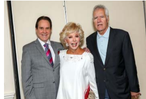
Honoree RICH LITTLE with RUTA LEE and ALEX TREBEK .