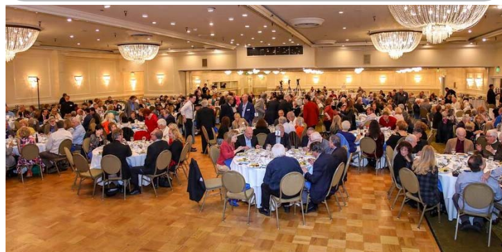
A huge crowd jammed the Empire Ballroom at Sportsmen's Lodge when PPB honored impressionist and voice actor RICH LITTLE .